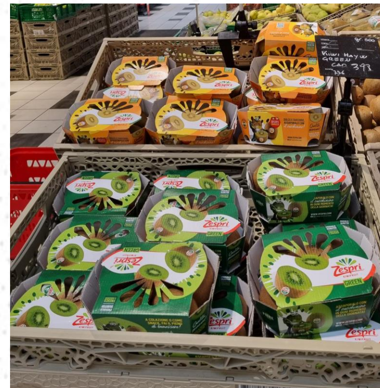
Zespri SunGold – NZ