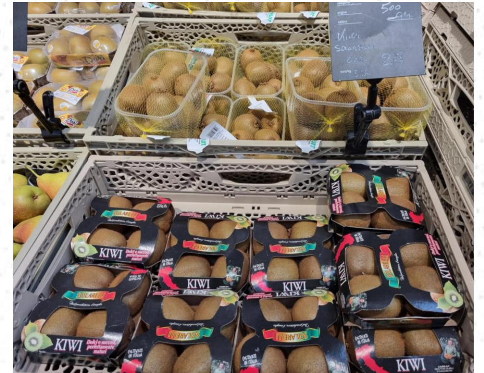
Green - Italy