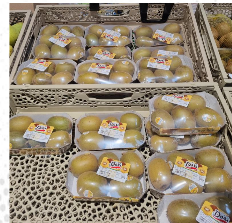
Dori Gold - Chile